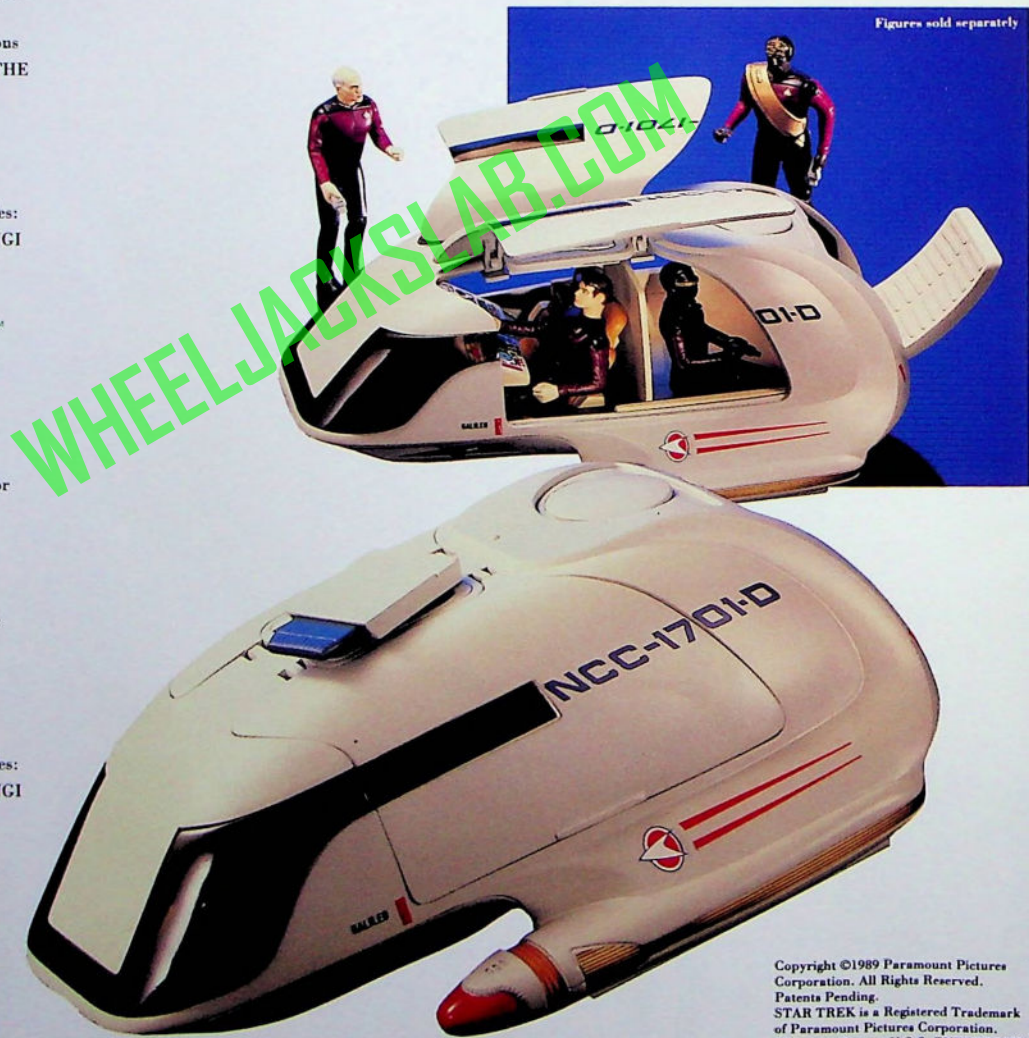
Figures sold separately