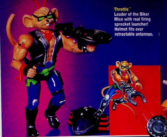
Throttle™ Leader of the Biker Mice with real firing sprocket launcher! Helmet fits over retractable antennae.