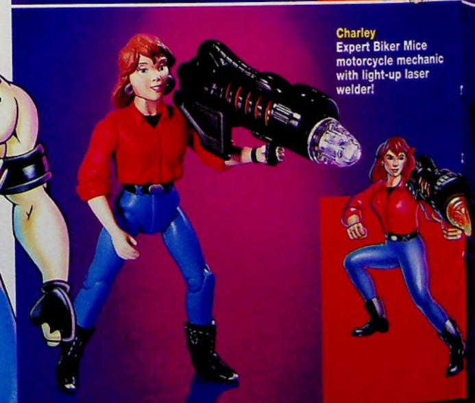
Charley Expert Biker Mice motorcycle mechanic with light-up laser welder!