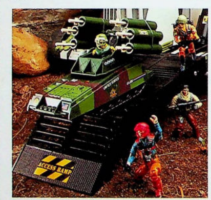
Hidden Loading Platform!

A tremendous, mobile, land based headquarters that serves as G.I. Joe's main battlefield command center when combating Cobra<sup>™</sup>! Flip up the loading platform to reveal the spring action mortar cannon with 4 launchable shells. Produces sounds of battle — diesel engine roar, mortar cannon, missile fire, machine gun, pom-pom gun and combat horn. Includes working light system in radar rack for added combat excitement! Deploy the Locust<sup>™</sup> copter for quick air strikes. Also includes 8 machine gun stations, 12 removable missiles, driver MAJOR STORM<sup>™</sup> and more. PK: 3