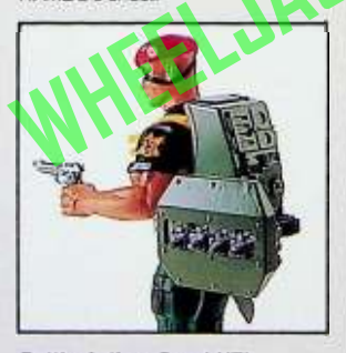
Battle-Action, Quad-UZI Attack Shield!

GRIPPER has inreatened that the next time he meets RAMBO he's going to carve his initials into RAMBO's chest!