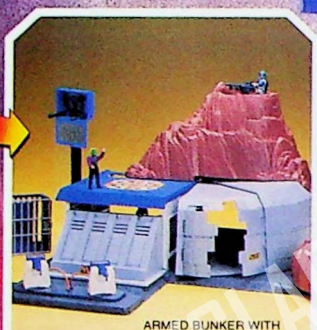
ARMED BUNKER WITH MULTIPLE WEAPONS SYSTEMS AND HIDDEN FEATURES