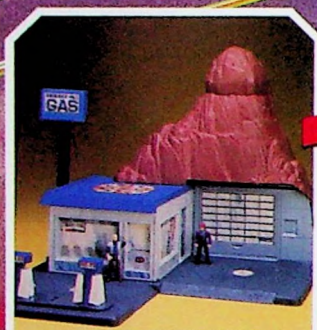
REALISTIC SERVICE STATION QUICKLY CHANGES TO...