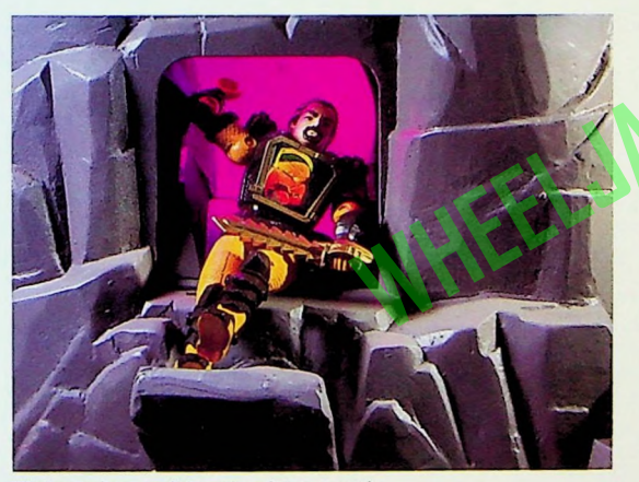
With treacherous slide-action detour caves!