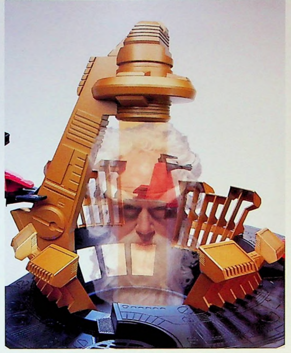
Magically, the holographic image of Merklyn begins to appear.