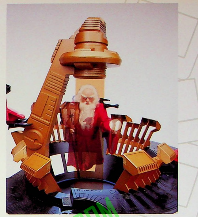
Merklyn's ghostly 3-dimensional image hovers within the Holodrome.