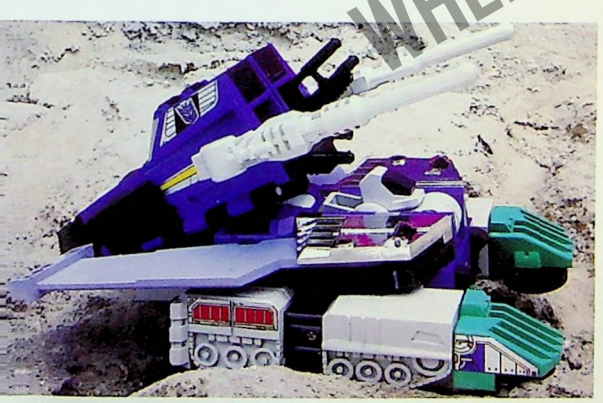
mm 4: Tank