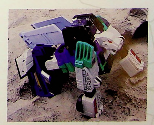
Form 6: Flying Wolf